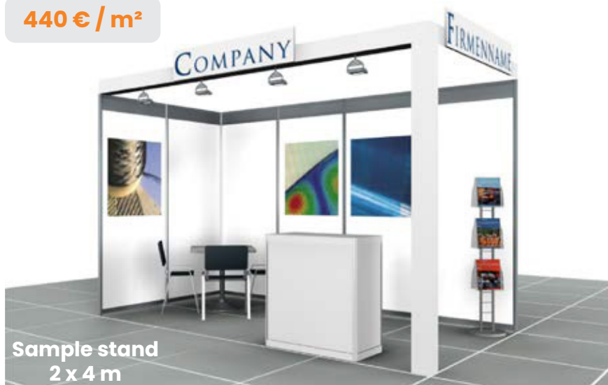
Sample stand 2 x 4 m